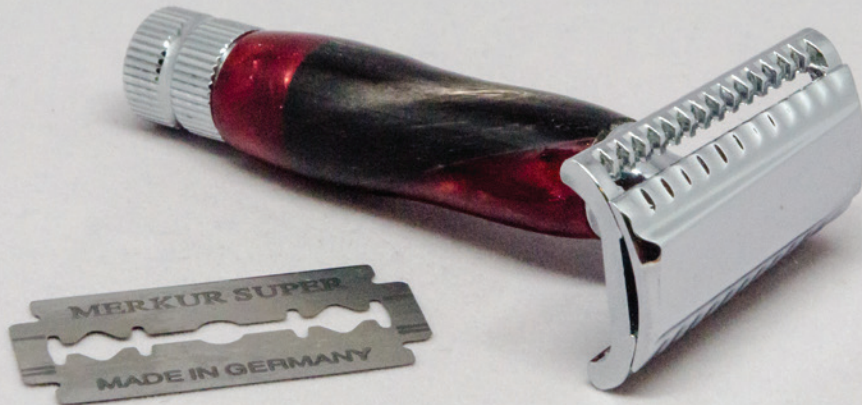
Razor: Buffalo horn and resin mixed media, German-made Merkur razor

There is always another way. The grooves, nicks and splinters that traverse this piece of buffalo horn are proof. The buffalo have thrived in the extreme conditions of the Great Plains, enduring sweltering summers and frigid winters. Buffalo are mostly blind, making their way in the world using an acute sense of smell and hearing. Once on the brink of extinction, their resilience has yet again restored them to their rightful place, free and roaming the Northern Plains of Alberta. Buffalo horn is a symbol of strength we don't yet know we have.