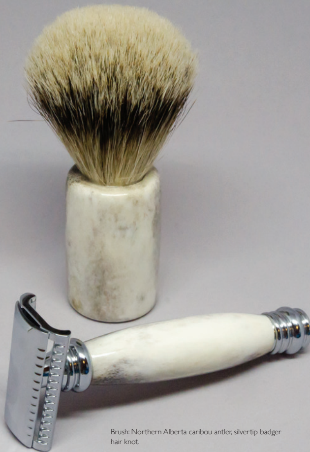
Brush: Northern Alberta caribou antler; silvertip badger hair knot.

We carry our story with us wherever we go, but we also find new ways to understand it. These fragments of caribou antler have carried their story thousands of miles across the Northern woodlands of Alberta, travelling farther than any other land mammal. In the spring if you were to grasp a caribou by the antler, it would be warm, velvet covered and waxy. It is bone growing outside its body. Worn by both the male and female caribou, they shed and regrow their antlers each season. Caribou antlers are a symbol of the journey and its ability to reshape us.