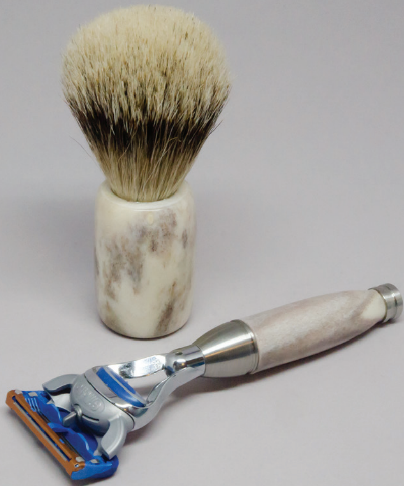
Brush: Elk antler from southern Alberta, silvertip badger