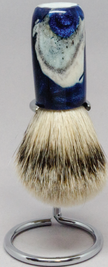
Brush: Buck antler (south western Alberta) and resin mixed media. Stand: Custom fit chrome

Buck antler is a relic that embodies the spirit of the protector. White tail bucks live in small herds, foraging together at dawn and dusk. They never rest in the same spot twice, instead creating a new home together each night. They are each other's best protection, taking turns standing guard while the others forage. The crown of bone atop their heads is part weapon, part shield, but also a tool ensuring the formation of a strong lineage. Buck antler symbolizes the urge to watch over those in our care.