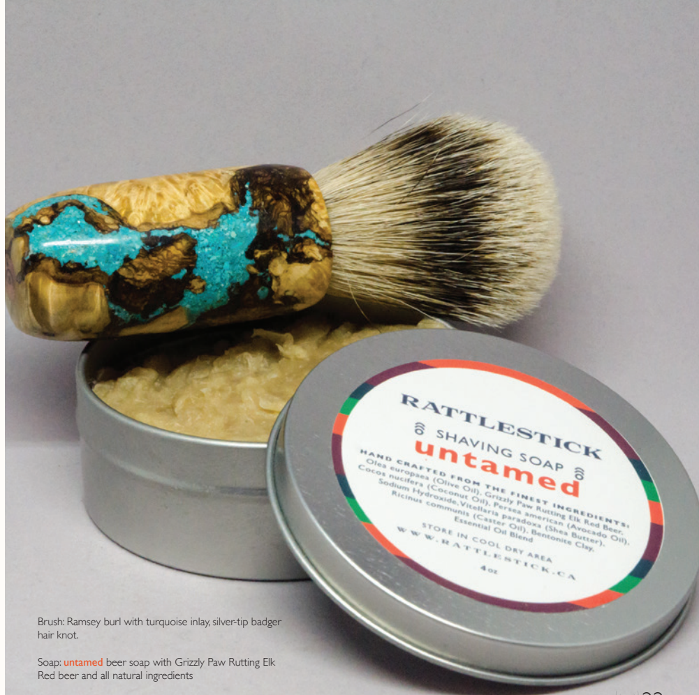
Brush: Ramsey burl with turquoise inlay, silver-tip badger hair knot.

barbarian backroom lounges, the smell of whiskey mixed with the sweet smell of tobacco echoes through the middle notes of juniper, coffee and myrtle in this very urban fragrance. Engage your barbarian!