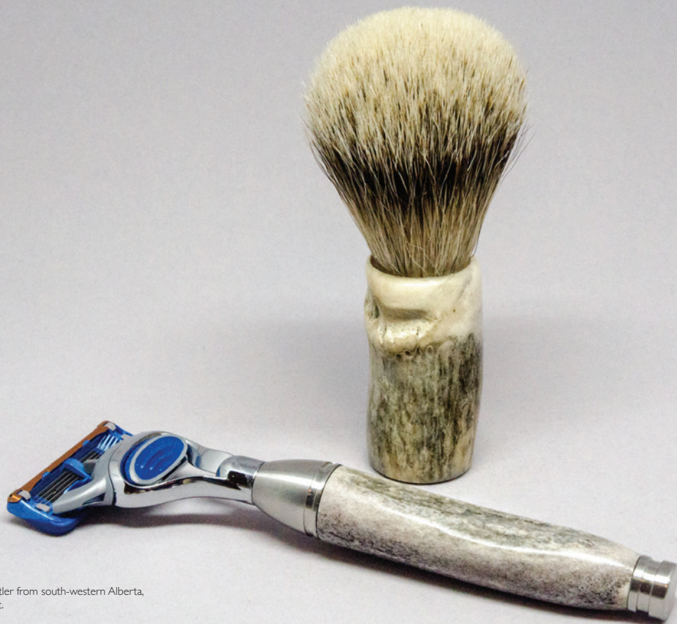
Brush: Live edge buck antler from south-western Alberta, silver-tip badger hair knot.