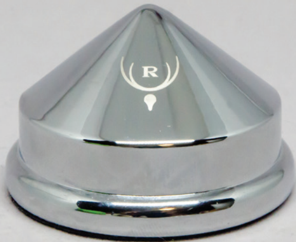
Stand: Chrome plated cone stand with Rattlestick logo Mach 3 and Fusion razors

Brushes should be hung brush side down to dry with the handle wiped free of excess moisture. Made from medical grade stainless steel, your razor should be wiped dry before storing.