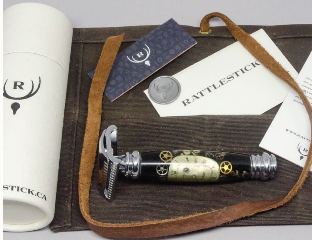
Packaging: Waxed canvas wrap with leather tie, bundled with Rattlestick envelope containing the story card, sealed with Rattlestick's wax seal

Our craftsmanship processes, products and packaging are designed with creating minimum waste and a small footprint.