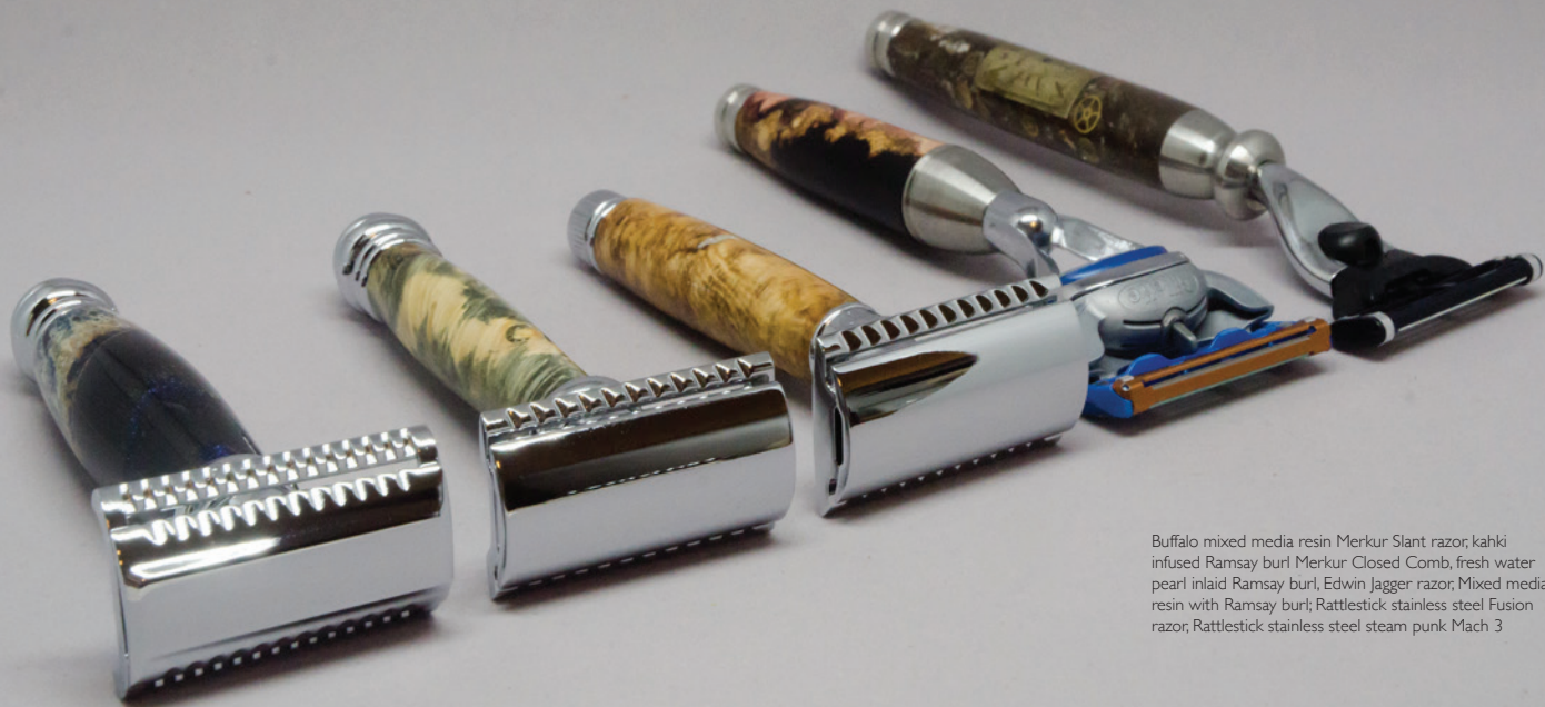
Buffalo mixed media resin Merkur Slant razor, kahki infused Ramsay burl Merkur Closed Comb, fresh water pearl inlaid Ramsay burl, Edwin Jagger razor, Mixed media resin with Ramsay burl, Rattlestick stainless steel Fusion razor, Rattlestick stainless steel steam punk Mach 3