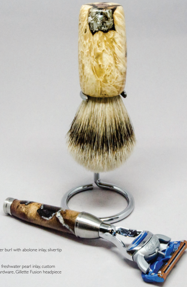
Brush: Ramsay box elder burl with abalone inlay, silvertip badger hair knot.

Adversity can destroy but it can also create. Like the pearl that forms from a grain of sand inside the shell of an oyster, a tree creates burls to protect itself from an irritant. Instead of growing in concentric circles, the grain of wood twists and curves finding a new way to be in the face of a problem. Burled wood symbolizes forging a new path in the face of adversity.